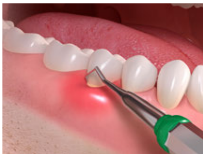
Removal of plaque and tartar

The first step consists in professionally cleaning the affected teeth to remove the bacteria which caused the disease. You are instructed how to clean your teeth optimally – even areas that are difficult to reach, such as interdental spaces.