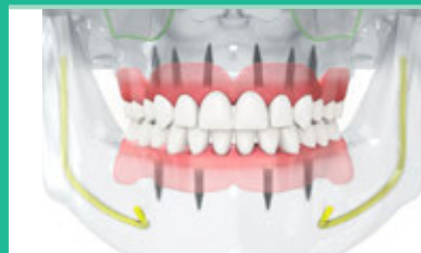
Straumann® Mini Implant System